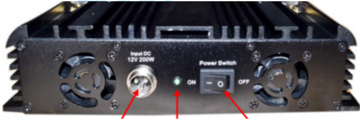
DC 12V Power Jack Pilot Lamp Power Switch

After connecting all the necessary components and securing the cables, press the switch on the left side to the "ON" position. The jammer will start operating, indicated by a green power pilot lamp.